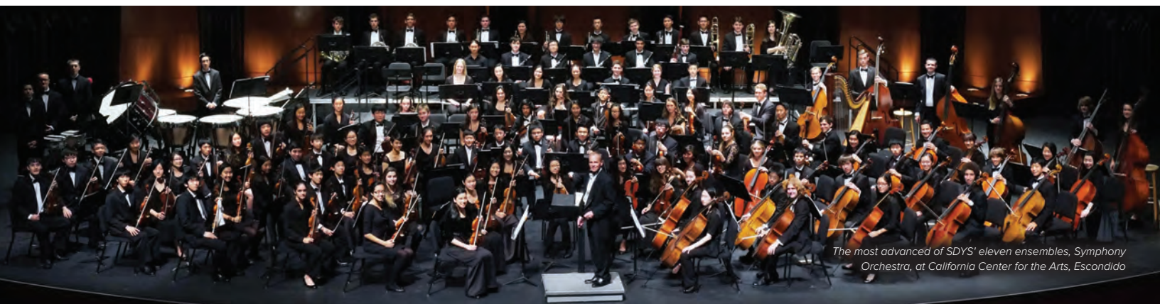
The most advanced of SDYS' eleven ensembles, Symphony Orchestra, at California Center for the Arts, Escondido