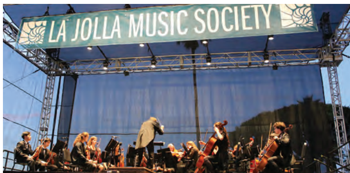
SDYS' 10th International Youth Symphony perform at La Jolla Music Society's SummerFest 2014