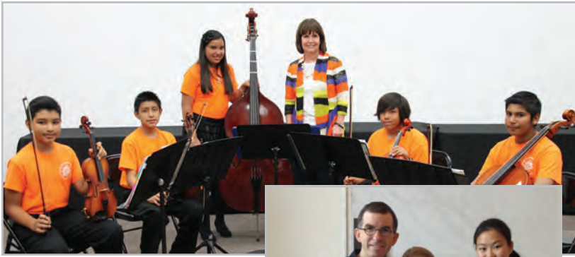
The Opus Quintet with Congresswoman Betty McCollum, Minnesota