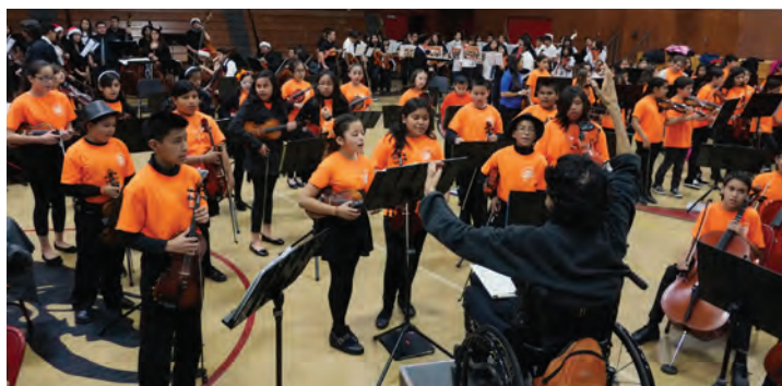
Community Opus Project musicians perform with middle and high school bands in the Winter Community Concert at Castle Park High School

Partnership is essential to the impact SDYS has in the community and the range of opportunity we deliver to our musicians. SDYS continued to work closely with La Jolla Music Society to provide the most advanced Balboa Park Program musicians performance and master class experiences with international artists. In the community setting, SDYS' partnership with UC San Diego expanded through our collaborative research with the Center for Human Development and with STEAM Connect to promote arts education alongside STEM subjects. As an active member of the Balboa Park Cultural Partnership, we work with the 26 arts, culture and science institutions in the park to improve the Balboa Park Experience. SDYS continues to collaborate with the Preuss School and with Price Philanthropies programs in City Heights.